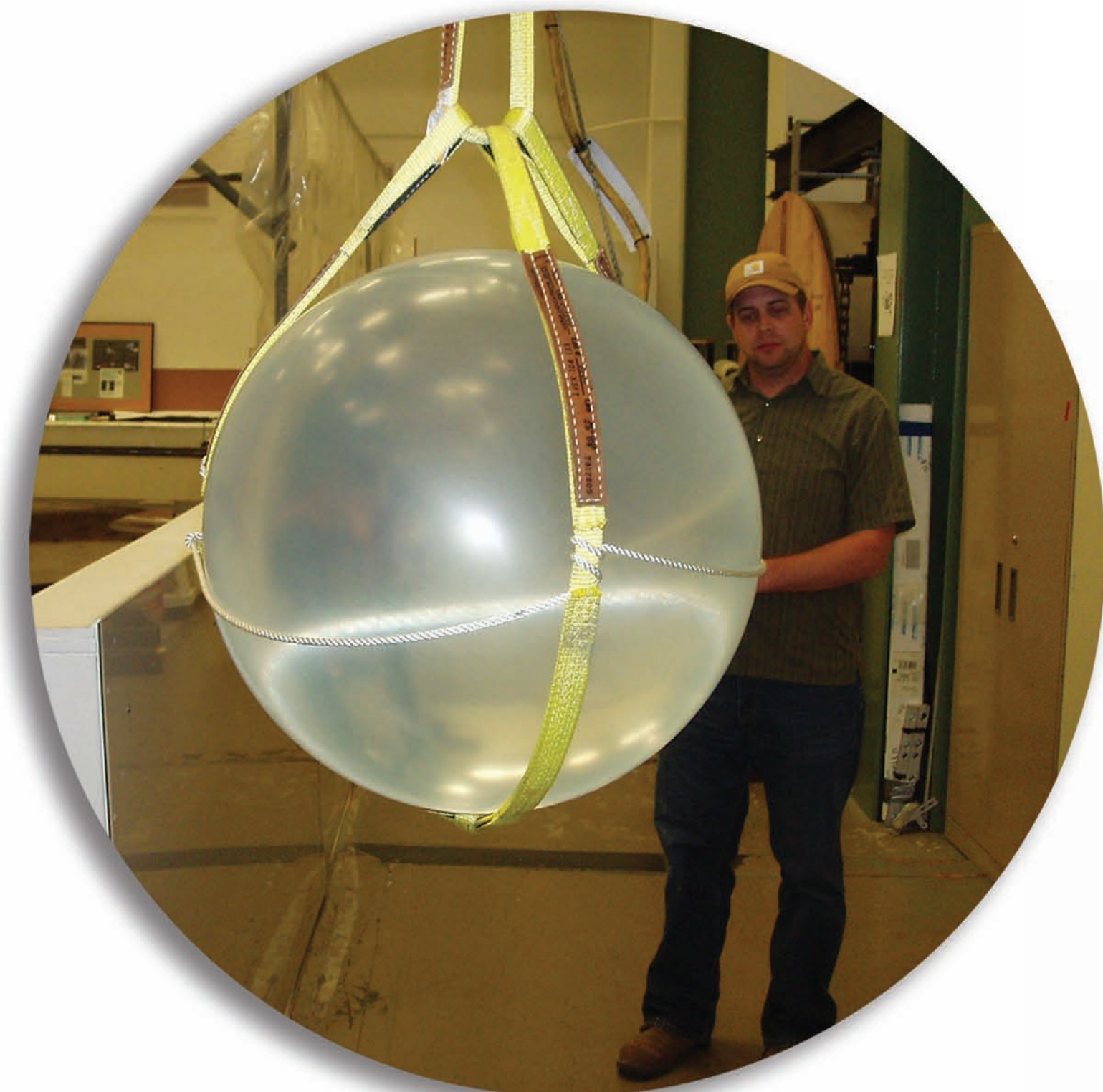
Unfinished sphere arrives at OSC 2010