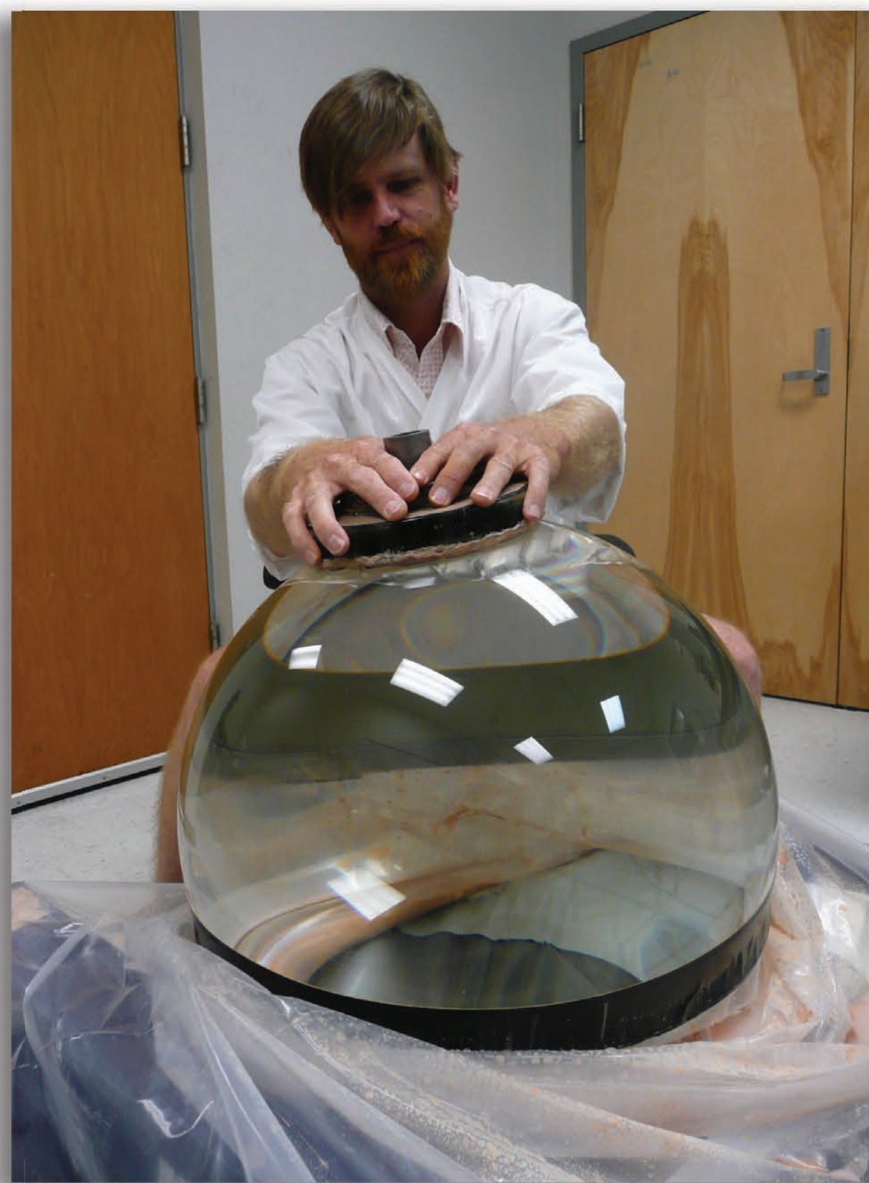
The magic fingers.