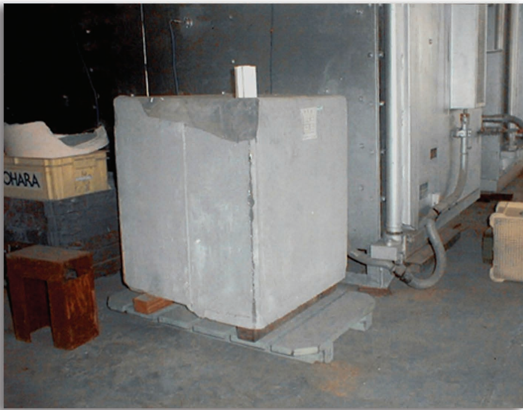
High quality S-BSL7 Borosilicate crown glass at Ohara Date: 2,000 Dimensions: 53x53x60cm Weight: 500 Lbs